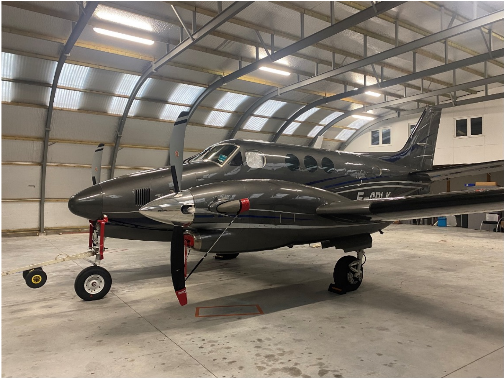
BEECHCRAFT KING C90B